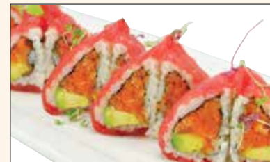
Sweet Heart Roll