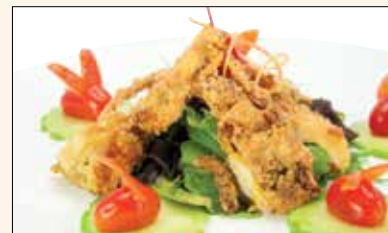
Soft Shell Crab